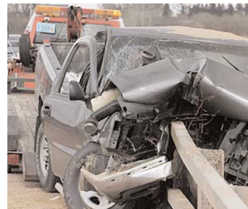
A pickup that went out of control rests on the guard rails of a bridge on a rural gravel road. The male driver was wearing a safety belt and survived the wreck.

We encourage you to join the campaign to save lives.